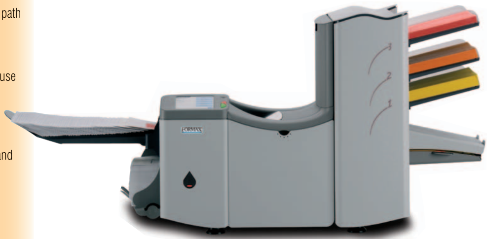
Shown with optional conveyor