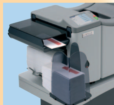
Optional Side Exit Tray