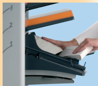
Optional Production Feeder holds 325 BREs or 1,200 sheets