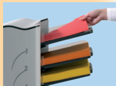
Horizontal feeders offer a loading capacity of up to 325 sheets each